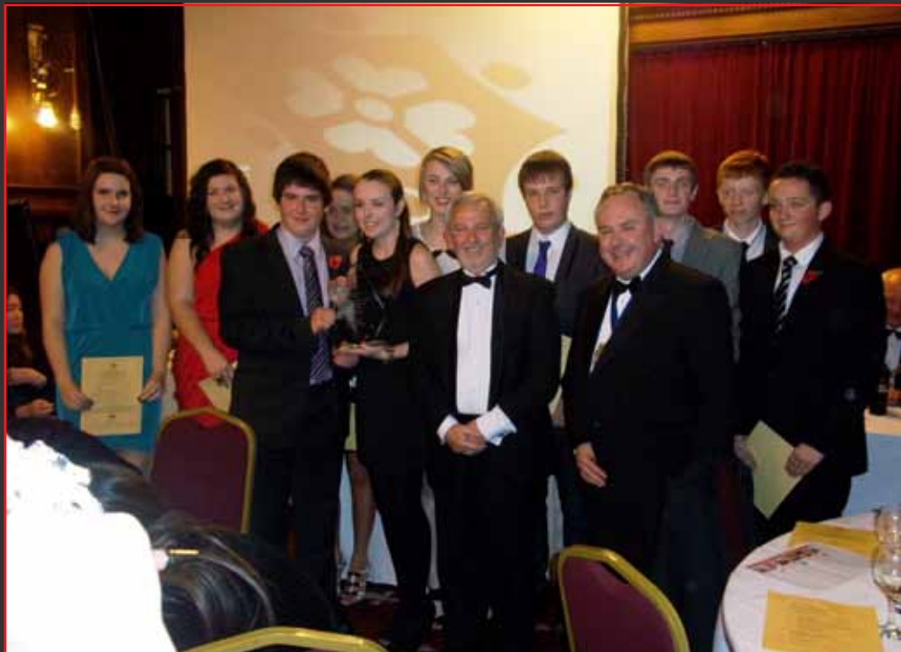
LIONHEART NATIONAL CHAMPION TEAM 2011 & KEY CATEGORY AWARD WINNER: BEST FINAL PRESENTATION

HISTORIC CITY OF LANCASTER, FRIDAY 4TH NOVEMBER 2011